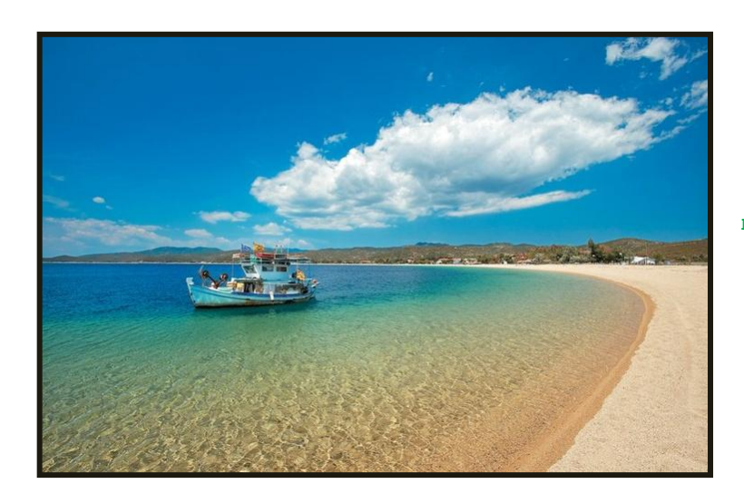
Halkidiki, a beautiful peninsula right next to Perrotis College

At the same time, Perrotis College is undergoing the NEASC Accreditation process to be fully recognized as an independent US-accredited higher education institution.