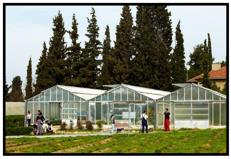
Students working @ the campus Green House