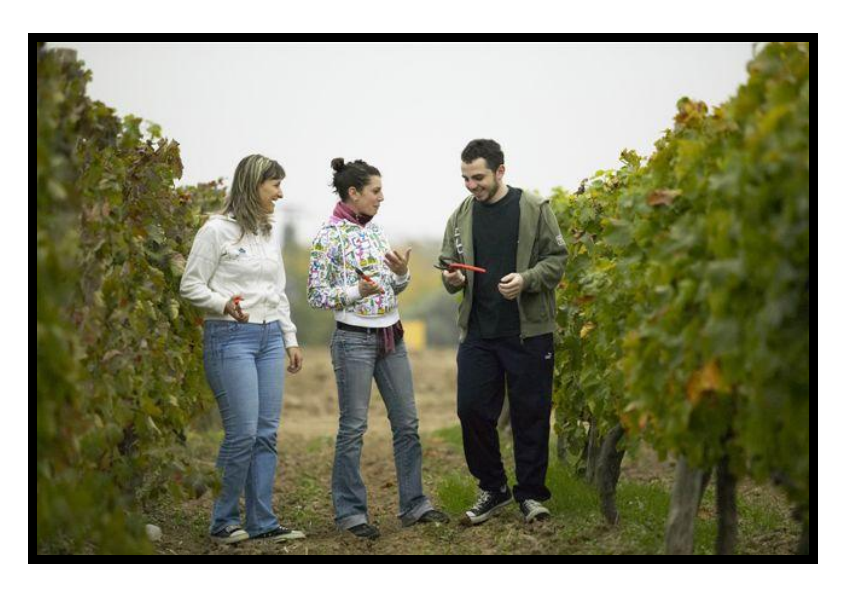
Students working \ensuremath{\text{@}} the campus vineyard