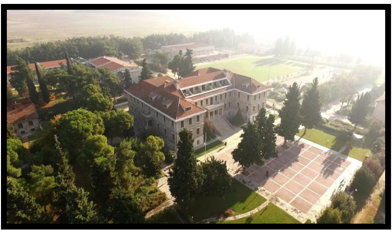
Aerial Photo: AFS/ Perrotis College campus

Dwight D. Eisenhower, President of the United States, 1958